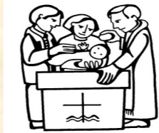
I baptize you in the name of the Father and of the Son and of the Holy Spirit

B aptisms: From 5th August Baptism services may proceed. However, they must follow all protective measures and social gatherings afterwards should be avoided.