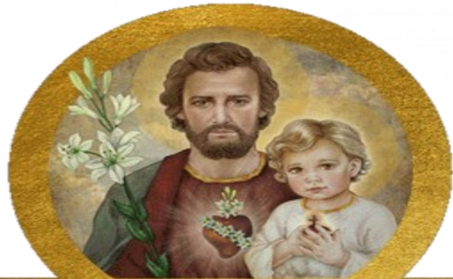
YEAR OF SAINT JOSEPH December 8, 2020 – December 8, 2021